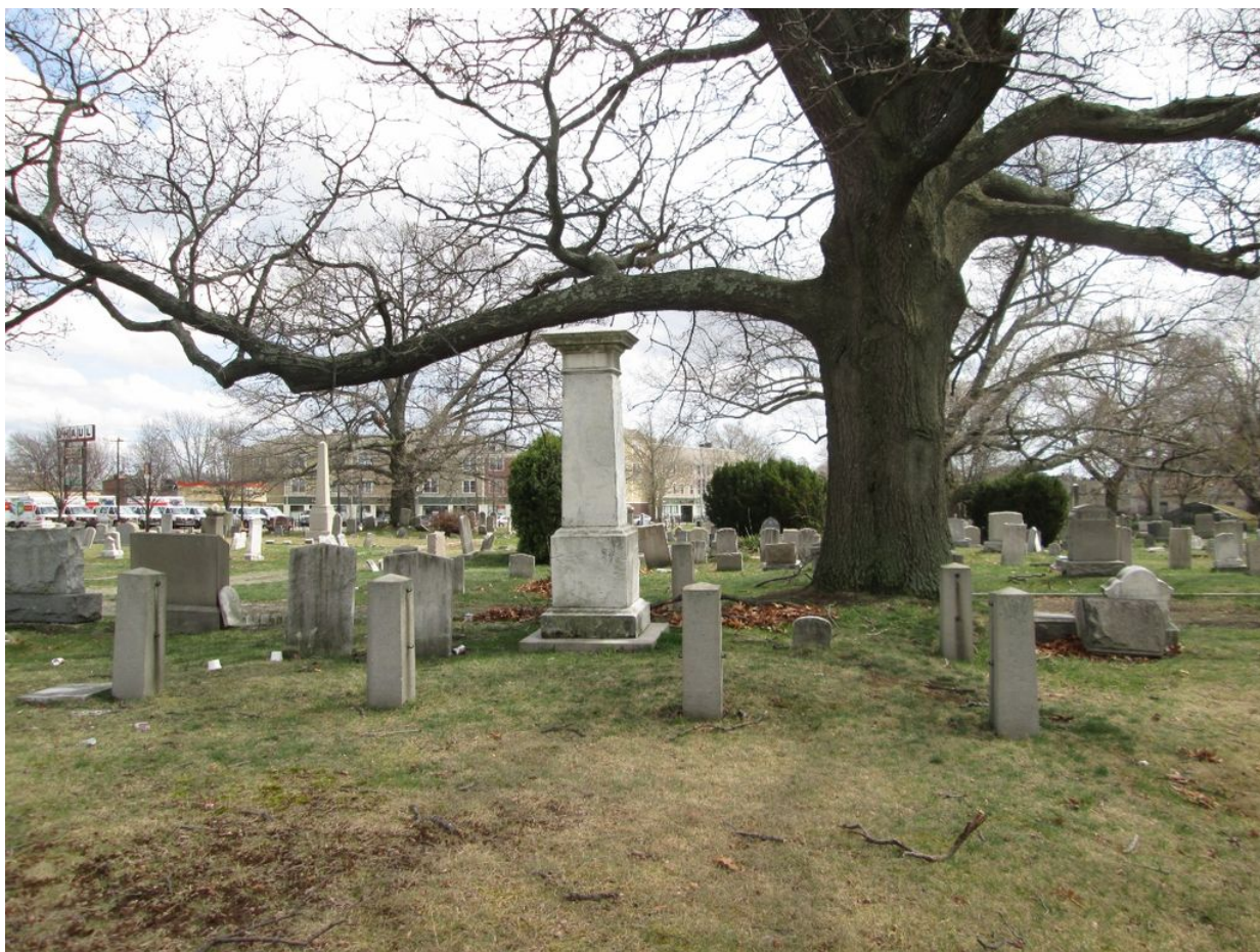
Grace Church Cemetery, Providence, Rhode Island